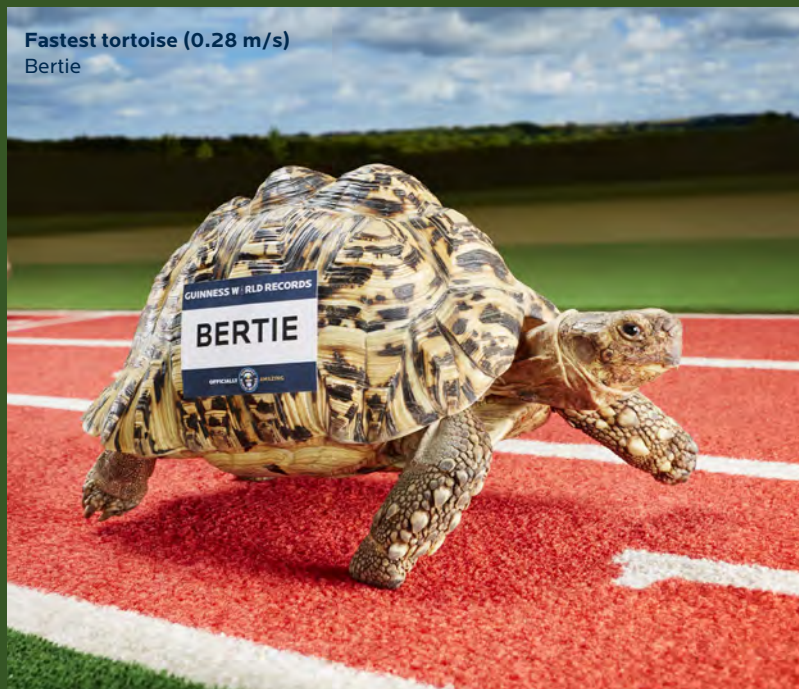
Fastest tortoise (0.28 m/s) Bertie