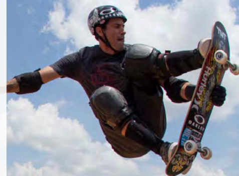
Most medals won at the Summer X Games by an individual (28) Bob Burnquist

Note: These challenges are just for fun and are not real record attempts. Please ensure this is communicated to all students taking part.